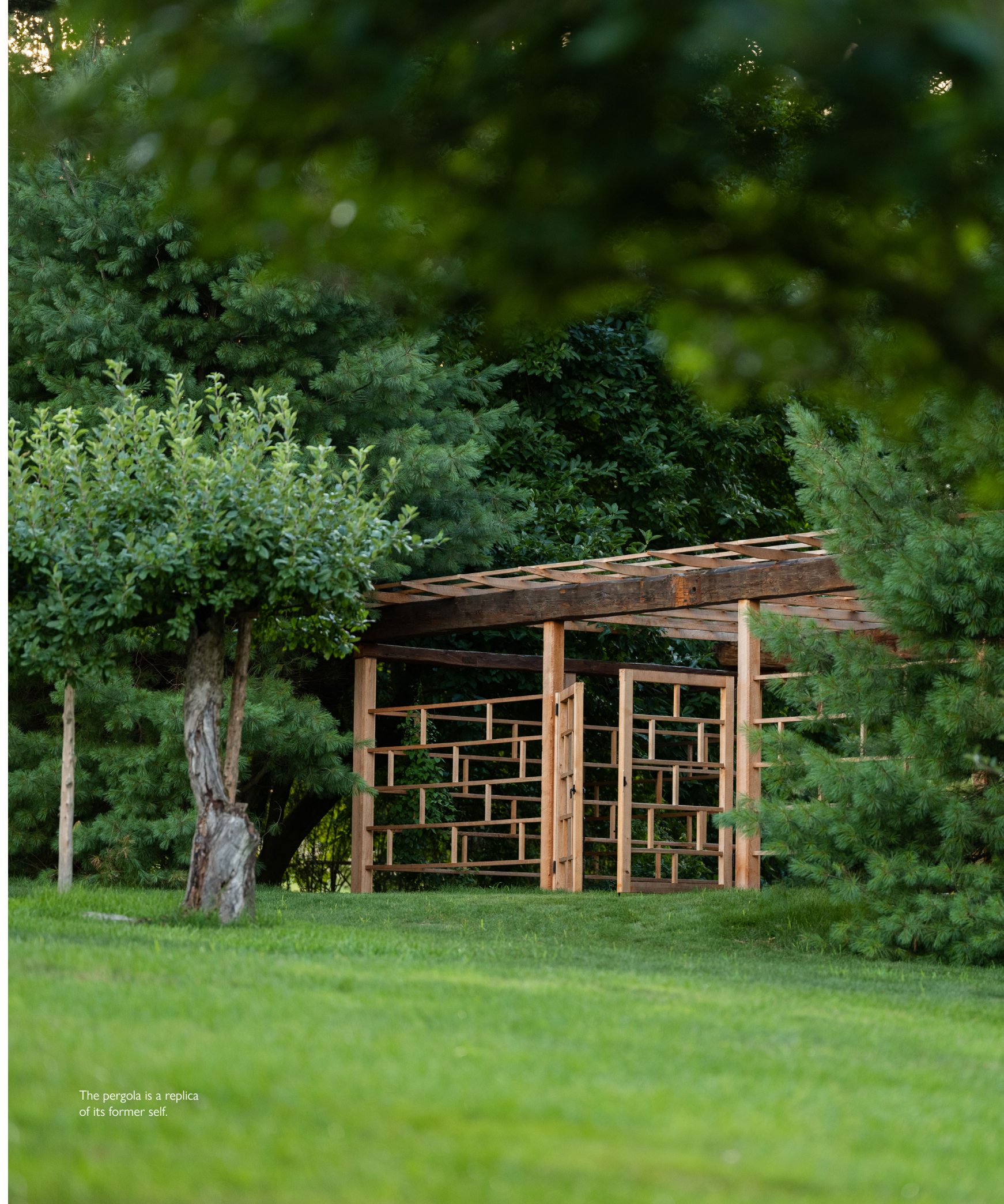
The pergola is a replica of its former self.

THE HERITAGE FARM PROJECT , a gently rolling northwestern piece of rural countryside, encompasses a 14.5-acre parcel of land in Litchfield County, Connecticut. This site featured a farm built in 1790 with a modest home, apple orchard, barns, fields, and a full complement of livestock and animals. The new landscape transforms the idea of a rustic barn in a field into a pastoral home in its natural surroundings.