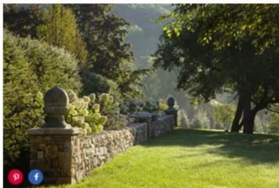
A stone wall lines a lawn.