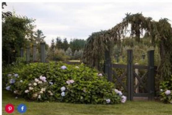
Evergreens can be seen throughout the design.