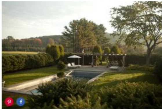
The pool is surrounded by pruned Christmas tree hedges.