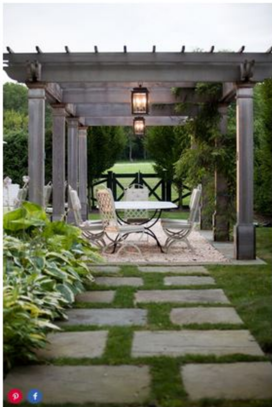
A patio for dining and entertainment.