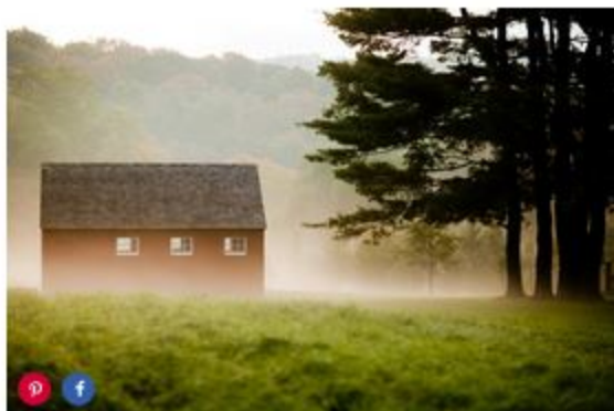
The grounds still retain their heritage as farmland.